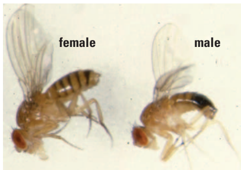
Figure 1. Determining the Sex of Fruit Flies

This procedure is designed to help you understand how to work with fruit flies. You may start with general information about how to determine the sex of a fruit fly. How do you tell the difference between male and female flies? Is the sex of the fly important to your investigations? Look at the female and male fruit flies in Figure 1. Then look at the fruit flies in Figure 2. Can you identify which ones are female and which ones are male? Focus on the abdomen of the flies to note differences.