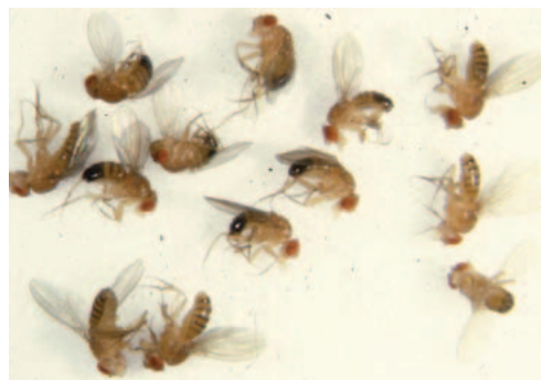
Figure 2. Fruit Flies

Step 1 Using fruit fly cultures, carefully toss 10 to 20 living flies into an empty vial. Be sure to plug the vial as soon as you add the flies. Do not anesthetize the flies before this or any of the behavior experiments.